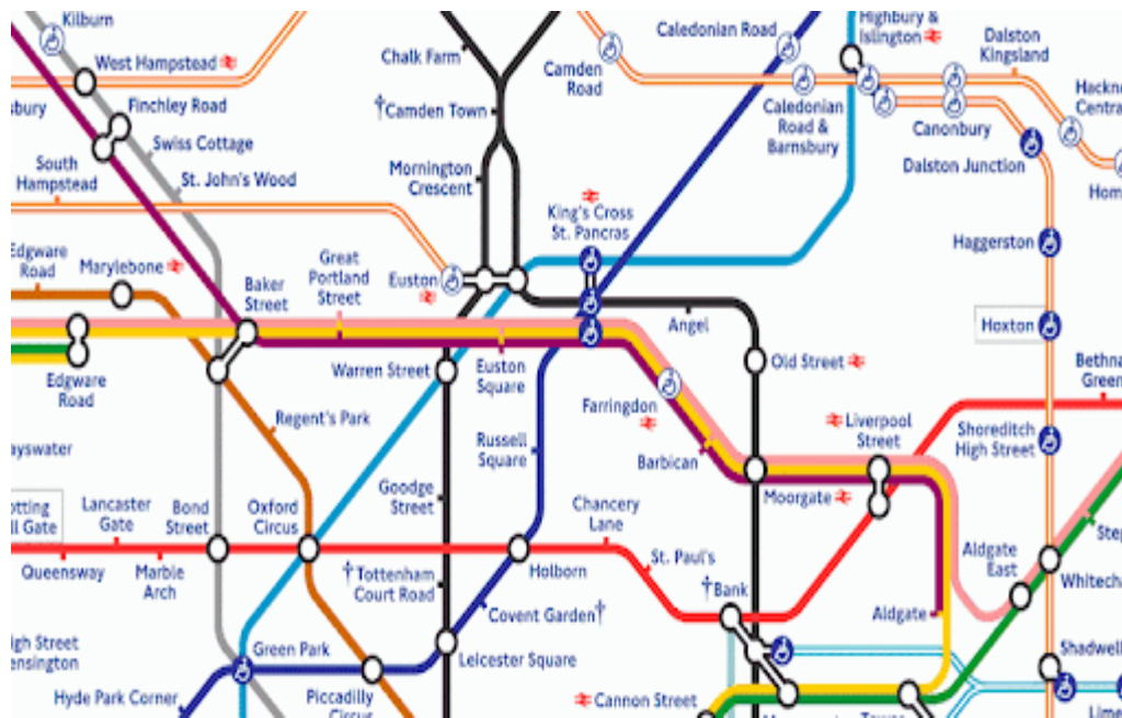
Figure 1: Section of the Tube Map.

and Paris. The central zones are the busiest and connect passengers to many of London's landmarks and financial hubs.