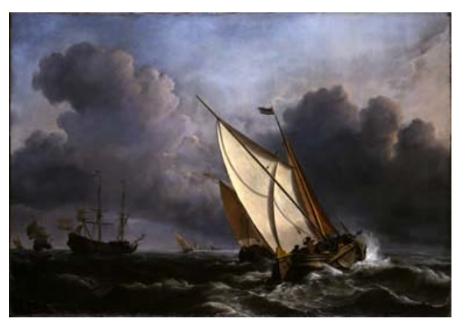
Willem Van de Velde the Younger A Rising Gale c.1672

Turner aquits himself variably well. In landscape he is superlative and often transcends his mentors. His skill in portraiture is not so convincing. I have to agree with a dyspeptic contemporary that his Jessica of !830 "look(s) like a lady getting out of a large mustard pot". Setting it near Rembrandt's Girl at a window of 1645 is an act of fairness but also great unkindness to JMW.