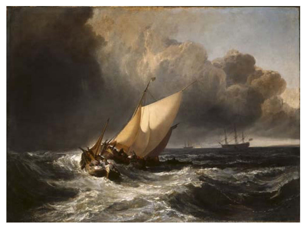
JMW Turner Dutch Boats in a Gale ('The Bridgewater Sea Piece') Exh. 1801 Private collection

As Newton says, knowledge is not formed in a vacuum, and Turner most emphatically did not spring fully-formed from the loins of history. The bone of contention, the question posed by this show, is this: was this admiration for his artistic forbears and peers companionable or competitive, rivalrous or adoring? It seems to me that the answer is that it is both.